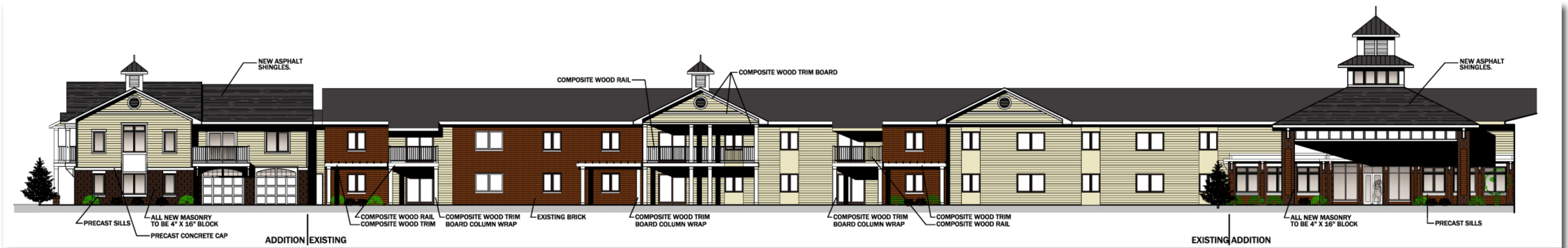
FRONT BUILDING ELEVATION