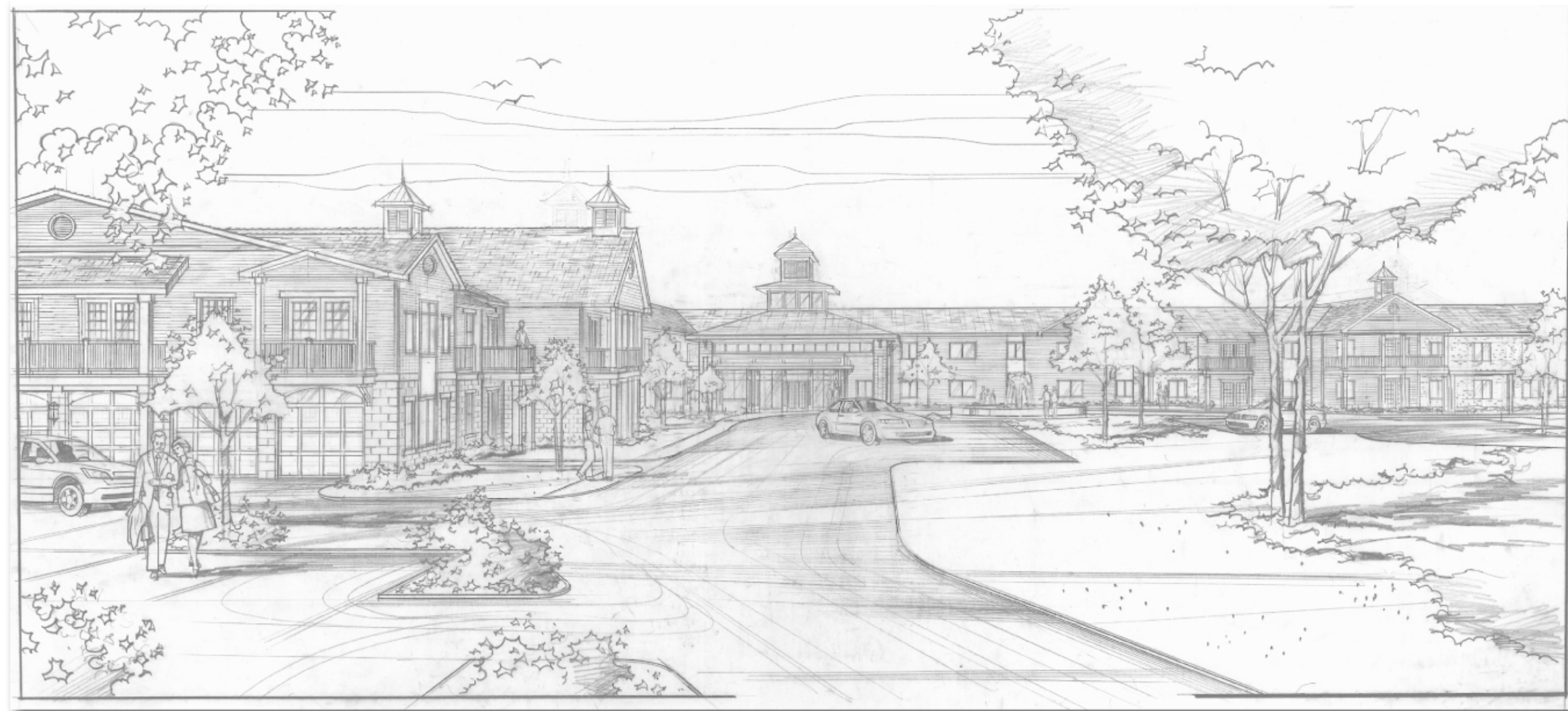
PERSPECTIVE - VIEW FROM MAIN DRIVE APPROACH.